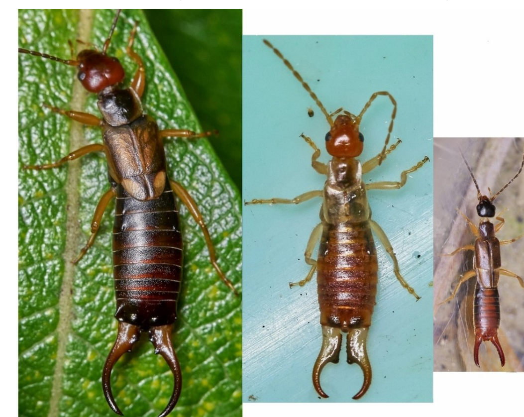
Common Earwig Key Features

Three species of earwig are found in Shropshire. The below photographs of males indicate their relative sizes: